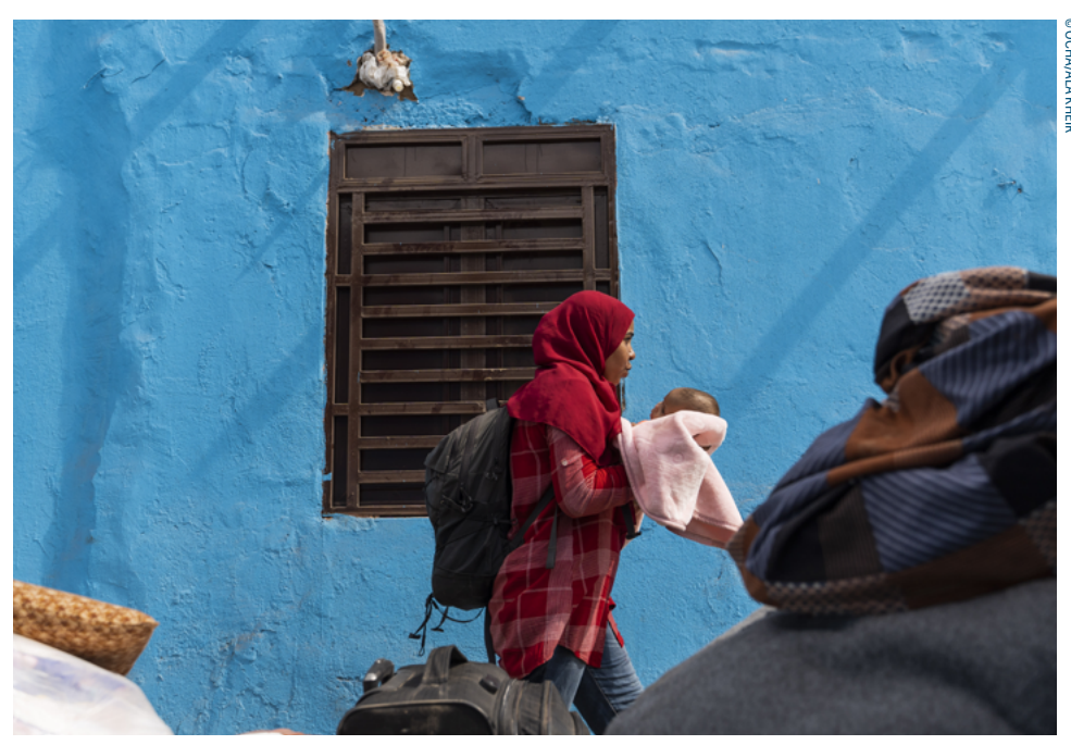
The 3.5 million people displaced since April 2023 are experiencing interrupted access to nutritious food, basic health services, safe and adequate water, and sanitation, worsening acute malnutrition among young children.

Refugee and returnee populations who fled the Sudan after the onset of the conflict and have sought refuge in the Central African Republic, Chad, Ethiopia and South Sudan had Mid-Upper Arm Circumference (MUAC) measurements indicating levels of wasting above the 15 percent 'very high' WHO threshold for all countries